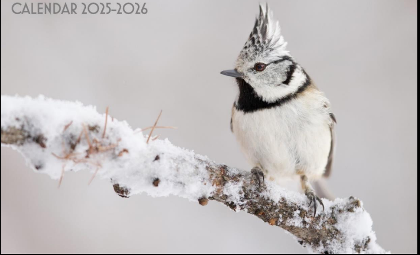
Brooke Haycock (Y12)