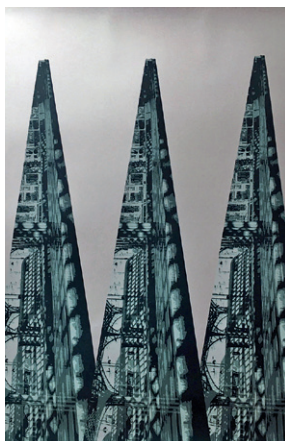
Lines I (Cologne)