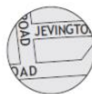
Out of bounds