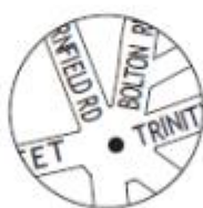
Extra bounds for town leave (the beach is out of bounds after 6pm)