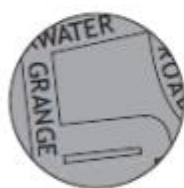
Normal College bounds