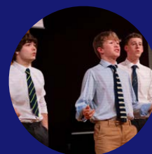
Proud a Cappella performance (p4)