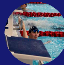
Bath Cup success (p7)