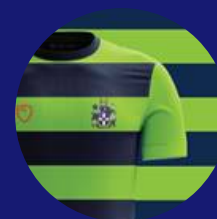
Inter-house results (p13)

The Lent Term has been an intense 10-weeks of College life, full of hard work and industry. The participation in all inter-house competitions; ranging from water polo to chess has been fiercely contested and I thank all those who have invested time and effort in these events. The introduction of the new TV has continued to be a huge hit; it has been joyous to watch the common room come alive with boys from all year groups bonding together, whilst chess and jazz pianists have add to the ambience of the space. Long may this continue. Beyond the walls of Powell, there has been a remarkable amount of productivity, endeavour and success to celebrate, which I hope to capture some of which, in this newsletter.