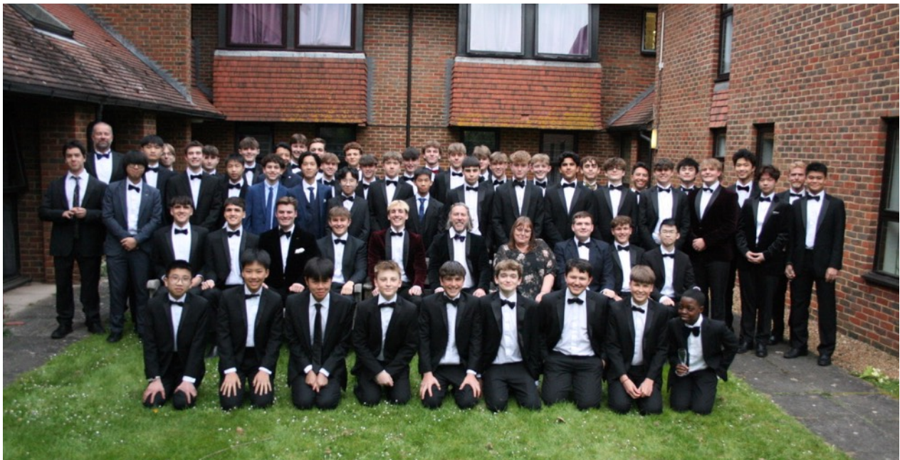
Boarders' Ball 2023