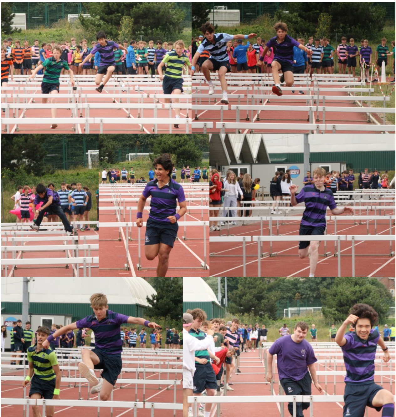
Gosh hurdles is hard!