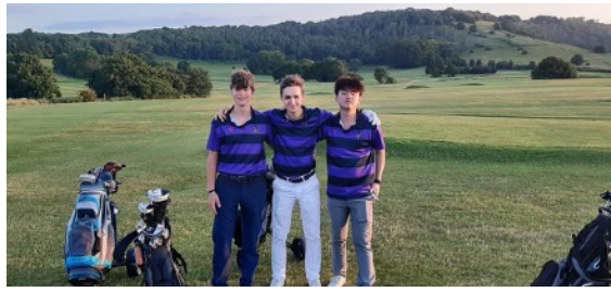
GOLFISTS ON TOP OF THE WORLD

OR THE SENSE OF JUBILANT CELEBRATION THAT SUCCEEDS IT.”