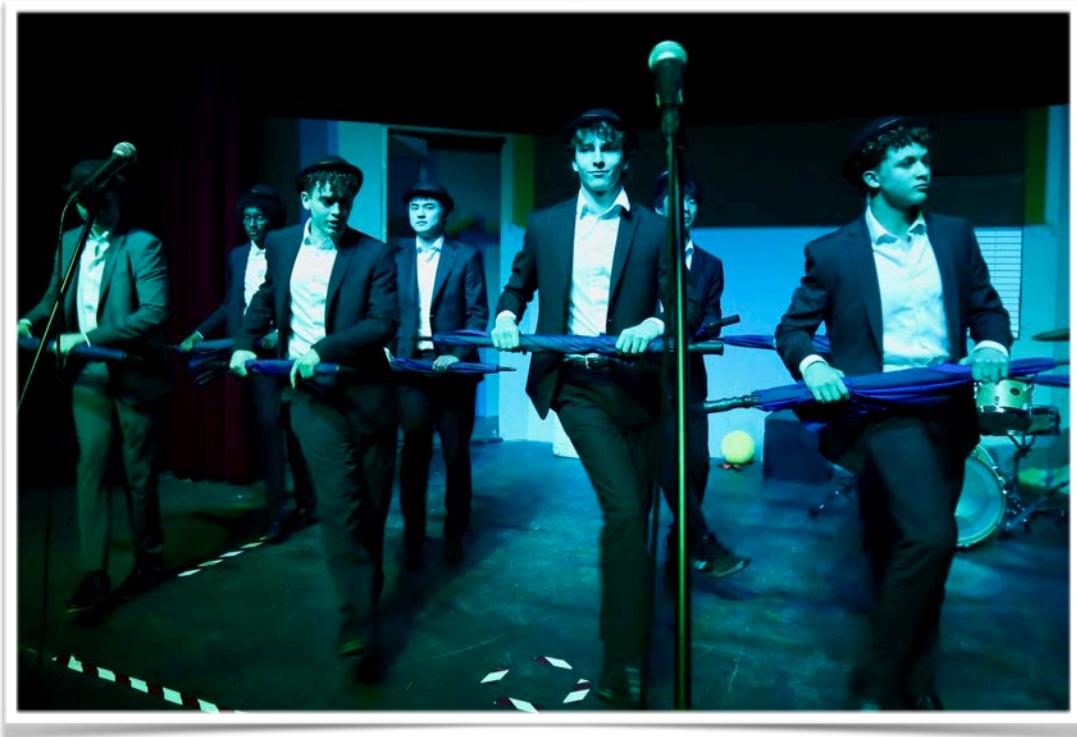
Y12s singin' in the rain