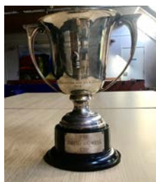
PENNELL CHESS CHAMPS