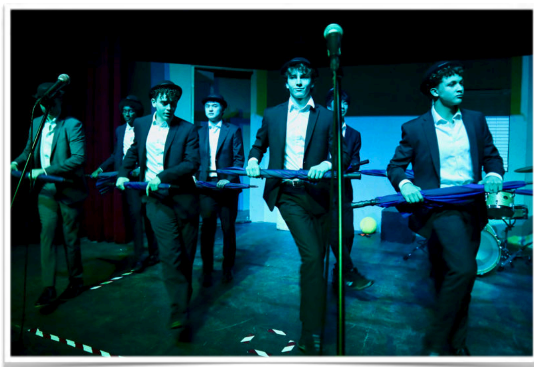
Y12s singin' in the rain