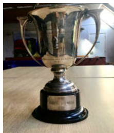
PENNELL CHESS CHAMPS