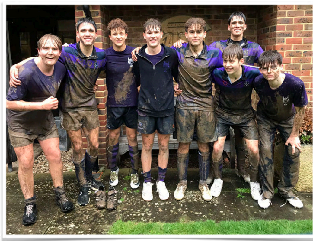
Pennell senior inter house toughmudder football