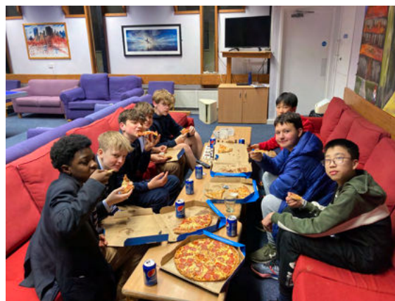
The pizza and, below, the advert

everyone (including some hsms...) gets very cross, but because winning is a pleasant feeling. I watched one nameless Y10 absolutely lose it with one of his team members in the swimming pool (and then again out of the swimming pool) during the inter house water polo because he had made a duff pass. Plotting a course to excellence is noble but failing to arrive is not a crime. I “carroted” pizza to the Y9s if they could sharpen up their act in the final few weeks of term (there had been some slipping punctuality, some post-lights-out out-of-beddedness and some indifferent preps) and when they stepped up they sealed the deal but one of them said he had done nothing excellent to deserve it. Excellence can be subjective and I value responding appropriately to direction, censure (or, in this case open bribery) as excellent when it achieves the desired result. And on subjectivity, I was very amused to see a very early advert for Eastbourne College (circa 1867) stating that “The education provided shall be Classical, Mathematical, and General”. And that’s it. A subjectively “excellent” curriculum if ever there was one! We are so blessed to have more than classicists and mathematicians in the house. In fact, “generalists” aptly sums up what a wonderful array of ability and interest we have within the house and I absolutely cherish that.