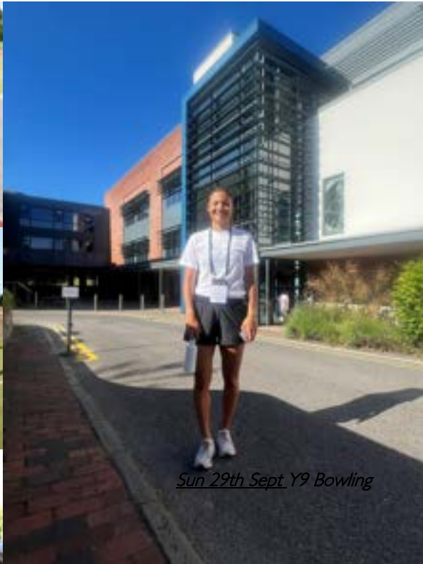
Sun 29th Sept Y9 Bowling