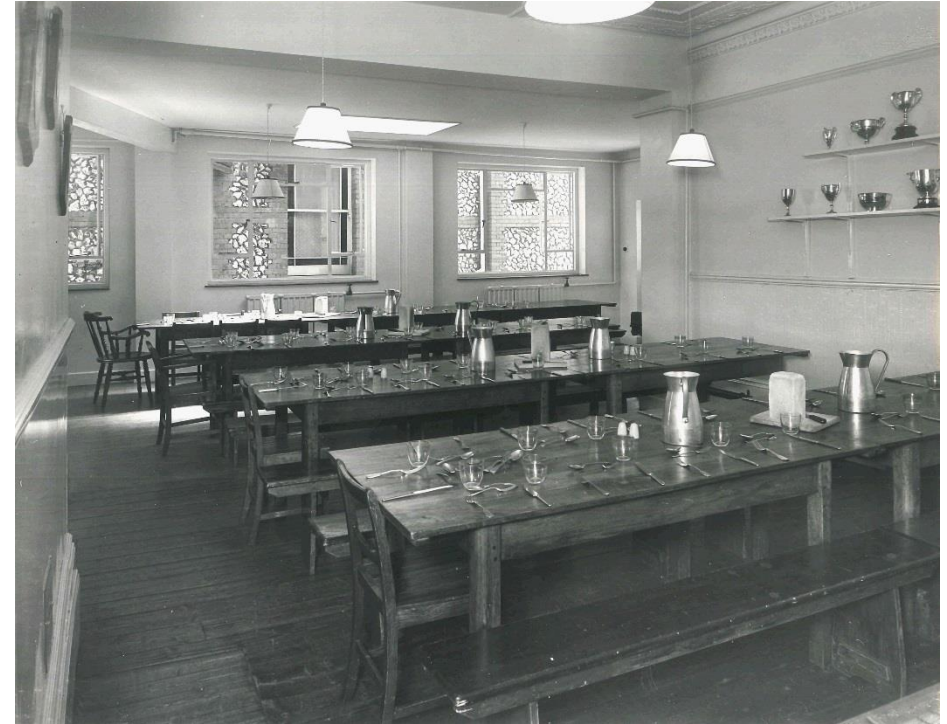
Wargrave House, c.1955 - very little change

Thursday 29 th Oct. Breakfast. Porridge. Sausages. Lunch. Roast Beef. Spicabi. Apricot-Sweet. Tea. Sandwiches. Jam. Friday 30 th Oct. Breakfast. Porridge. Bacon & Spaghetti. Lunch. Herrings. Boiled ginger pudding & custard. Tea. Fried eggs. baked beans. Jam. Saturday 31 st Oct. Breakfast. Porridge. Kippers. Lunch. Mince. Peas. Jam Tart. Tea. Boiled eggs. Apples. Sunday 1 st Nov. Breakfast. Porridge. Cold Ham. Lunch. Roast Mutton. Cabbage. Fruit Pudding. Tea. Cake. Jam. Oranges.