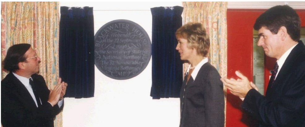
The Rt Hon Virginia Bottomley MP opening the new building in 1996