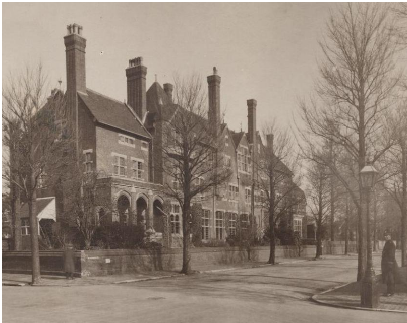
Blackwater House, Blackwater Road - built as a boys boarding house in 1873