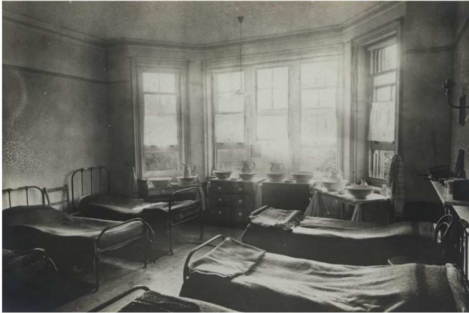
One of the boy's dormitories in the 1920s. Note the jugs and wash basins in the bay window.