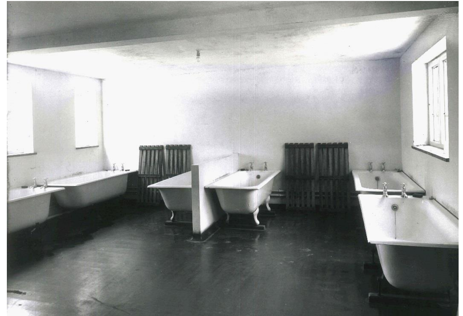
Gonville House bathroom in the 1950s