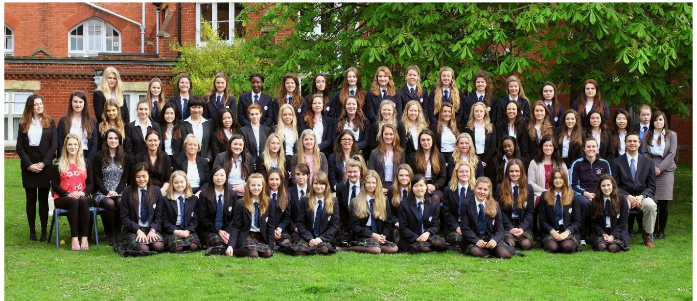
School House 2014, now a boarding house for girls