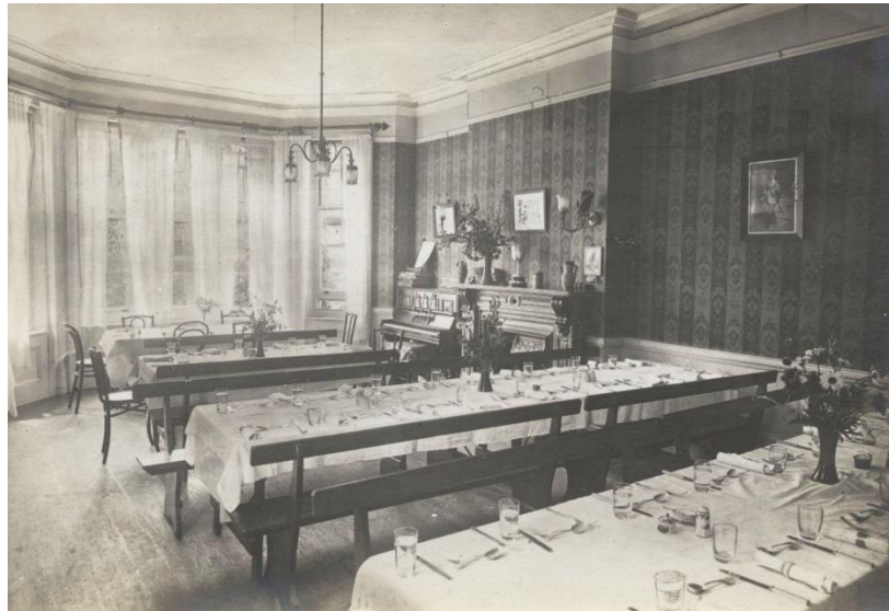
Gonville House dining room 1925