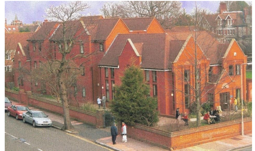
Blackwater House rebuilt as a girls day house