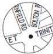
Extra bounds for town leave (the beach is out of bounds after 6pm)