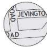
Out of bounds