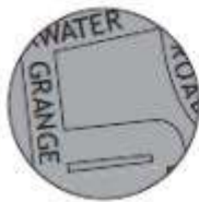
Normal College bounds