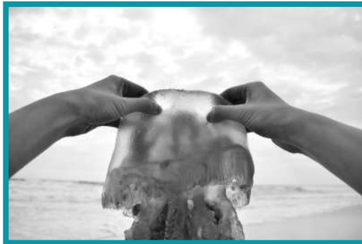
Aimée Wood's 2nd place entry