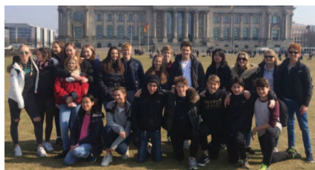
Berlin history trip