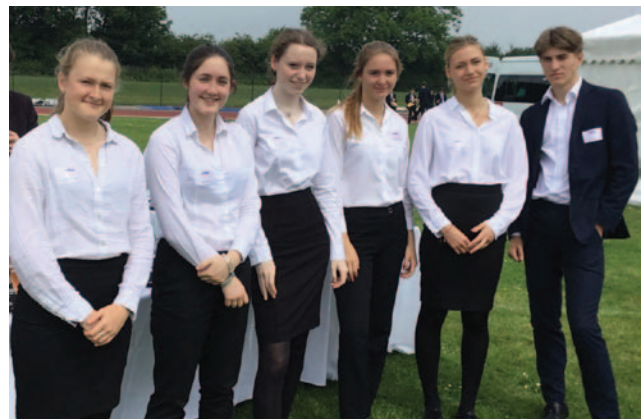
Lower Sixth pupils waitering at St Wilfrid's Hospice annual fundraising lunch

Some 100 members of the Lower Sixth were involved in a wide range of service activities including: working at charity shops, assisting at activities sessions for severely disabled adults at Chaseley Trust, maintaining wheelchairs in the Arndale Centre for the Shopmobility Service, organising bingo and quizzes for the elderly, running weekly Blue Health Beach Clean and overseeing College recycling, working with younger pupils in and out of the classroom at St Andrew's Prep, campaigning on behalf of prisoners of conscience through the College Amnesty Group, helping to set up Winter Night Shelter for homeless people in Eastbourne. Year 11 pupils on the pre-service course delivered their show of monologues, songs and carols to elderly people in the local community