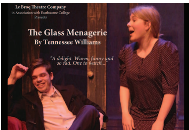
The Glass Menagerie at the Edinburgh Fringe

Every Year 9 pupil took part in the annual house drama competition directed by Lower Sixth pupils