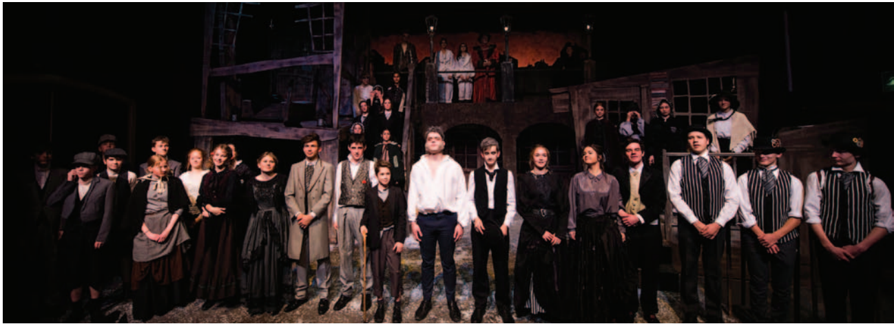
A Christmas Carol

At the College, we celebrate young people's creativity, nurturing and developing their skills from the day they arrive. Pupils work with top professionals across all the creative fields.