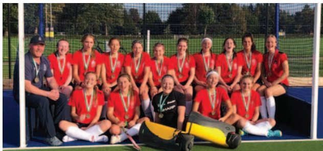
Girls U18 county champions