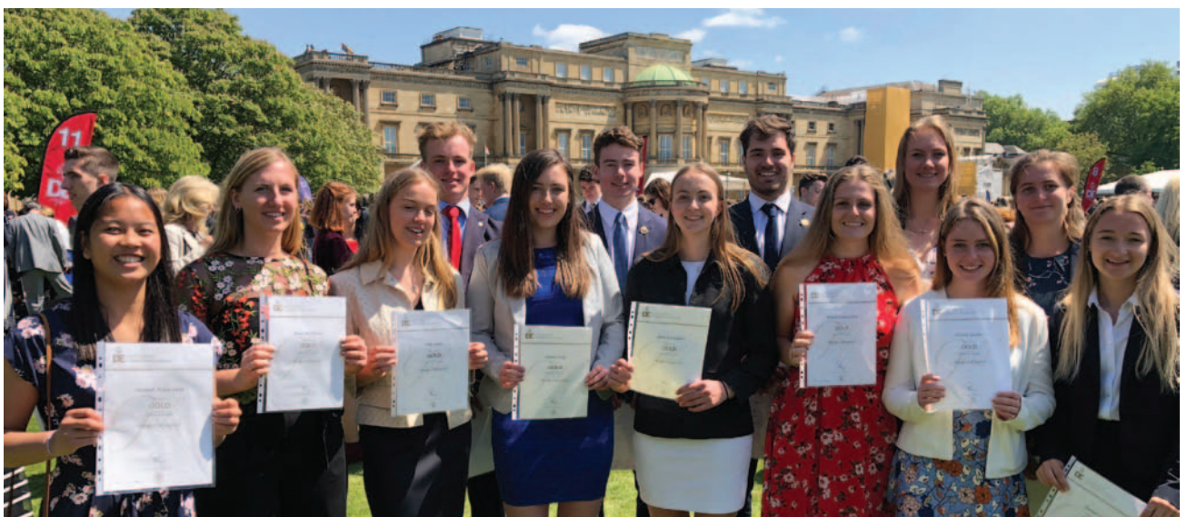
Thirteen pupils at Buckingham Palace

Forty-two pupils worked towards gold and 57 towards silver Duke of Edinburgh Awards. Thirteen pupils were invited to Buckingham Palace to receive their Gold Award from Prince Edward, Earl of Wessex