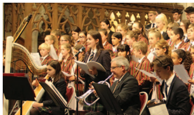
College and St Andrew's Prep pupils perform Rhapsody in Blue