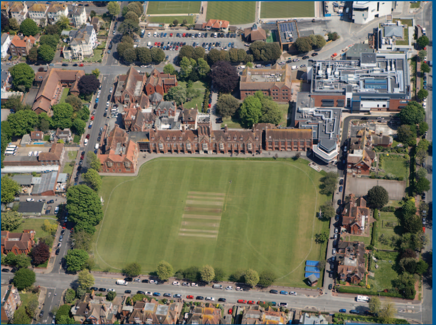
Aerial image of Project 150 completed