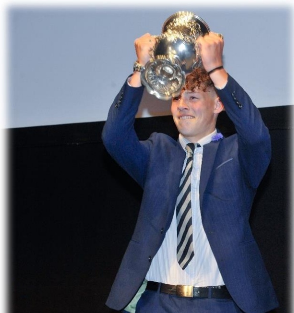
Cass Stallion lifting the house cup!