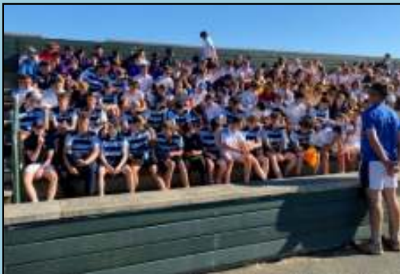
(Above) Some of our Year 10s enjoying the fine weather and doing some catching practice. (Left) Reeves athletes at Sports Day where they finished in second place.