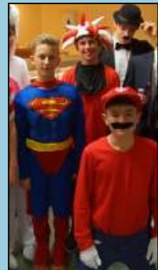
A fond farewell to this year's Upper Sixth pictured with their supportive parents before the Cornflower Ball.