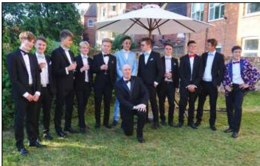
Our outgoing Upper Sixth dressed to impress before the Cornflower Ball.

A final and much deserved mention should go to Kay and Vicky who have helped maintain the fabric and cleanliness of the building as well as for their cheerful influence on the boys.