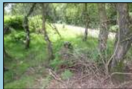
Cadets taking part in the concealment activity on Field Day