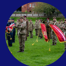
Remembrance Day (p7)