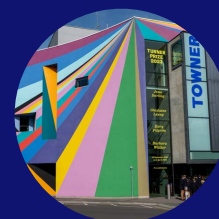
The Turner Prize (p3)

£270 was raised for the charity MIND at our house concert.