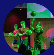
Powell House Revue (p13)