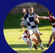
Sports round-up (p3)