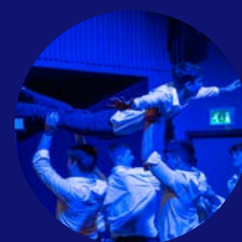
House Revue Photos (p13) - Flying y12