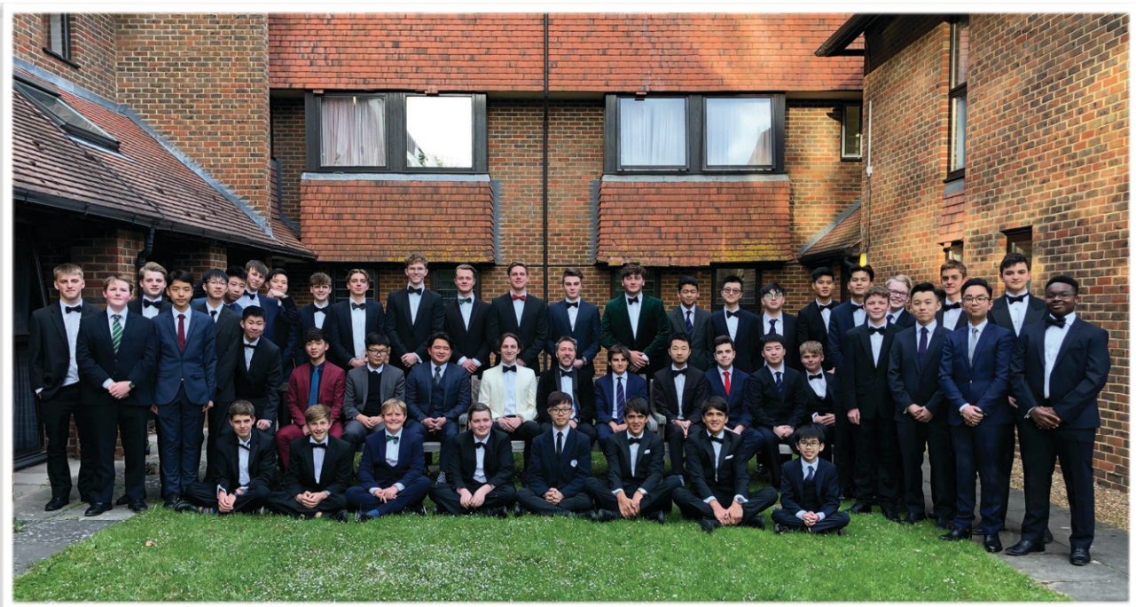
The house scrubs up well