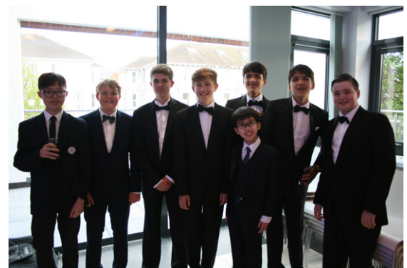
Our debonair Y9s

The photo above reminds me how long ago the start of term was. We’ll get onto it later but the boarders’ ball was superb fun and a lovely way to begin the most serious of terms. I think the boys have acquitted themselves very well in exam season. The GCSEs started even earlier than usual (please note: this seems to be the way of things from now on) which meant for a very drawn-out programme of exams. The upside of this is that only the unluckiest pupils got more than a maximum of two exams a day. I recall one year when a pupil was invited to stay in isolation overnight at the headmaster’s house because he had six in one day which could not physically be scheduled with even the minimum rest breaks. So one can see the logic although we teachers bemoaned the lack of last-minute polishing that we lost to the early start. Factoring in all the sport and co-curricular activities this term, however, and it is very evident how full a two-and-a-half months it has been.