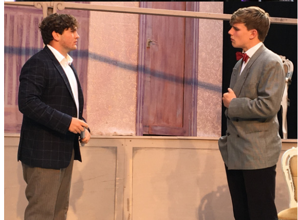
Big Ball Band; Ys12 and 9 with fish and chips on the beach; Max's "Hey Jude"; The Cot and Boniface-off