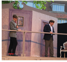
HEAD OF SCHOOL AND HEAD OF HOUSE TREAD THE BOARDS

AND A LOVELY WAY TO START THE MOST SERIOUS OF TERMS”