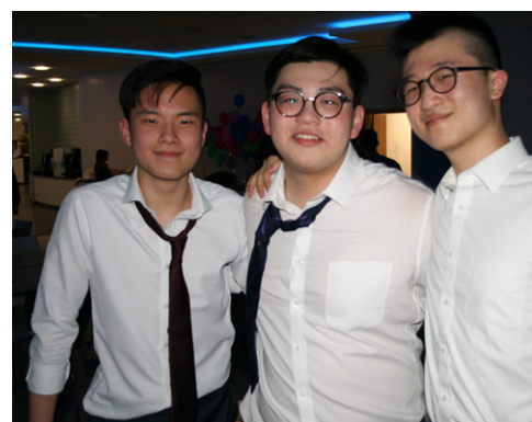
Y12s fully committed to the dancing

It was a bit of a risk, the inaugural “boarders’ ball”, and I know that some had immovable commitments that weekend so not all were able to attend, but it could have gone either way. I have terrible memories of being bussed from my all-boys boarding school to a local-ish all-girls boarding school. I recall being ushered into the headmistress’s study and being given a glass of sweet sherry which I thought (fittingly) was communion wine! Presumably this was to steady the rightly-assumed nerves. We were then shunted out into an antique wood lined hall and -