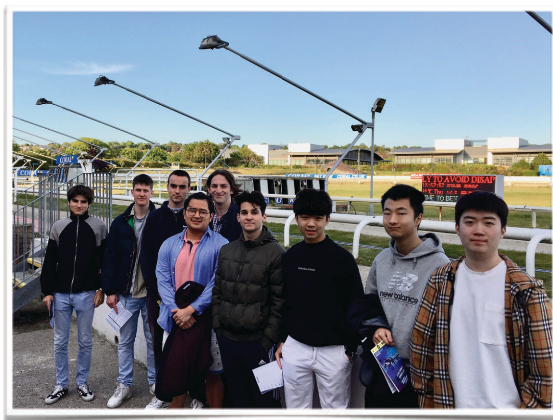
Y13 leavers at the dogs