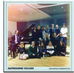
MAX RELEASES ANOTHER NEW ALBUM