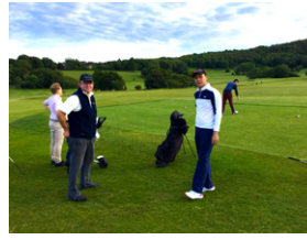
RUNNERS UP IN THE INTER HOUSE GOLF