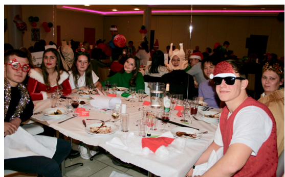
Y13s at the house dinner