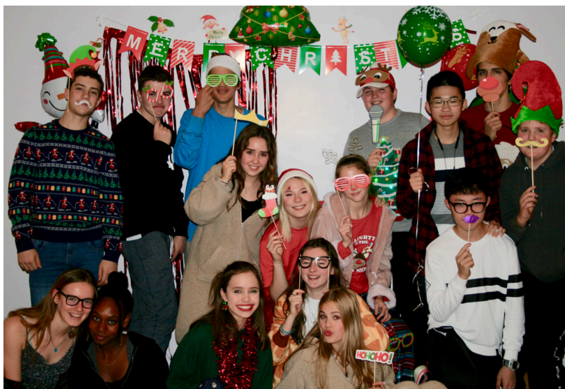
Y10s at the house dinner

A little festive music and Christmassy/nativity themed 'photo-boothing' brought a most enjoyable evening to a close. As ever, the boys were very relaxed and gracious company and it was lovely to link more sociably with another boarding house. I do know however that they are looking forward to a bit more of the traditional speeches, reflections and jokey prizes that come with a solo house event, so roll on the mountains of fried dumplings in the Lent Term!"