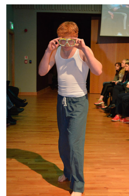
Bede in the fashion show

It was pleasing to see a number of Y13s involved in the Fashion Show at the end of term. The House Singing competition was its usual blend of undeniable passion, total commitment and questionable judging! Housemaster got it in the neck for song choice based mainly on the fact that at 2 minutes 21s (damage limitation) a 45 second instrumental needed probably some sort of choreography but I have to say that it's a cracking tune and the boys filled the house with it for weeks. It is quite something to hear such an earworm passed around the house on the way to prep from boy to boy. Follow this link for what it should sound like: Dreaming of You . The boys did a great job of it and did themselves proud.