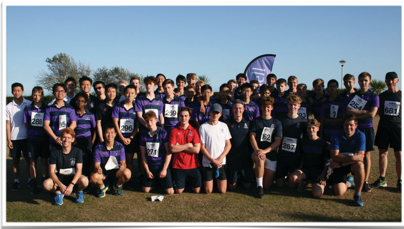
A decent house effort