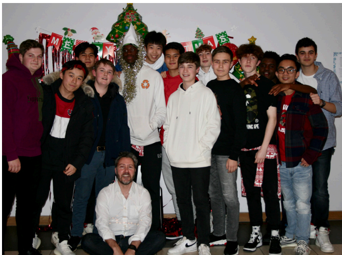
Y12s at the house dinner