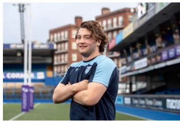
THEO: SIGNED, SEALED, AWAITING DELIVERY