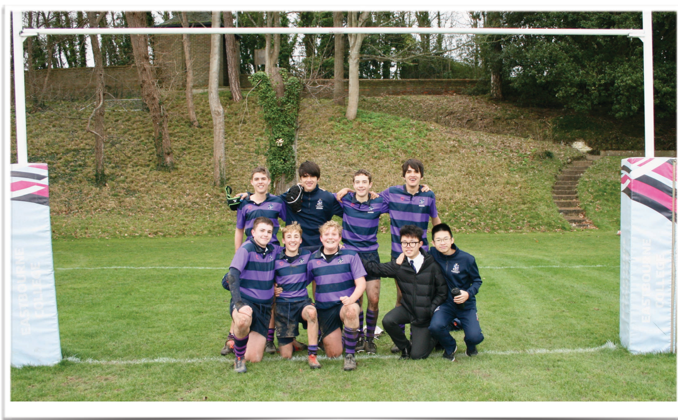
The victorious Y10s