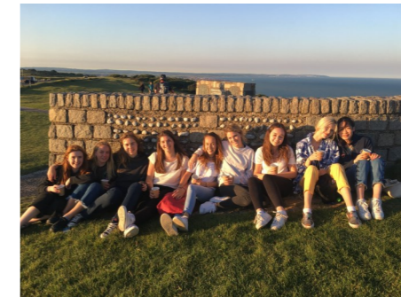
Upper 6th Leavers

Talent wins games, but teamwork and intelligence win championships.