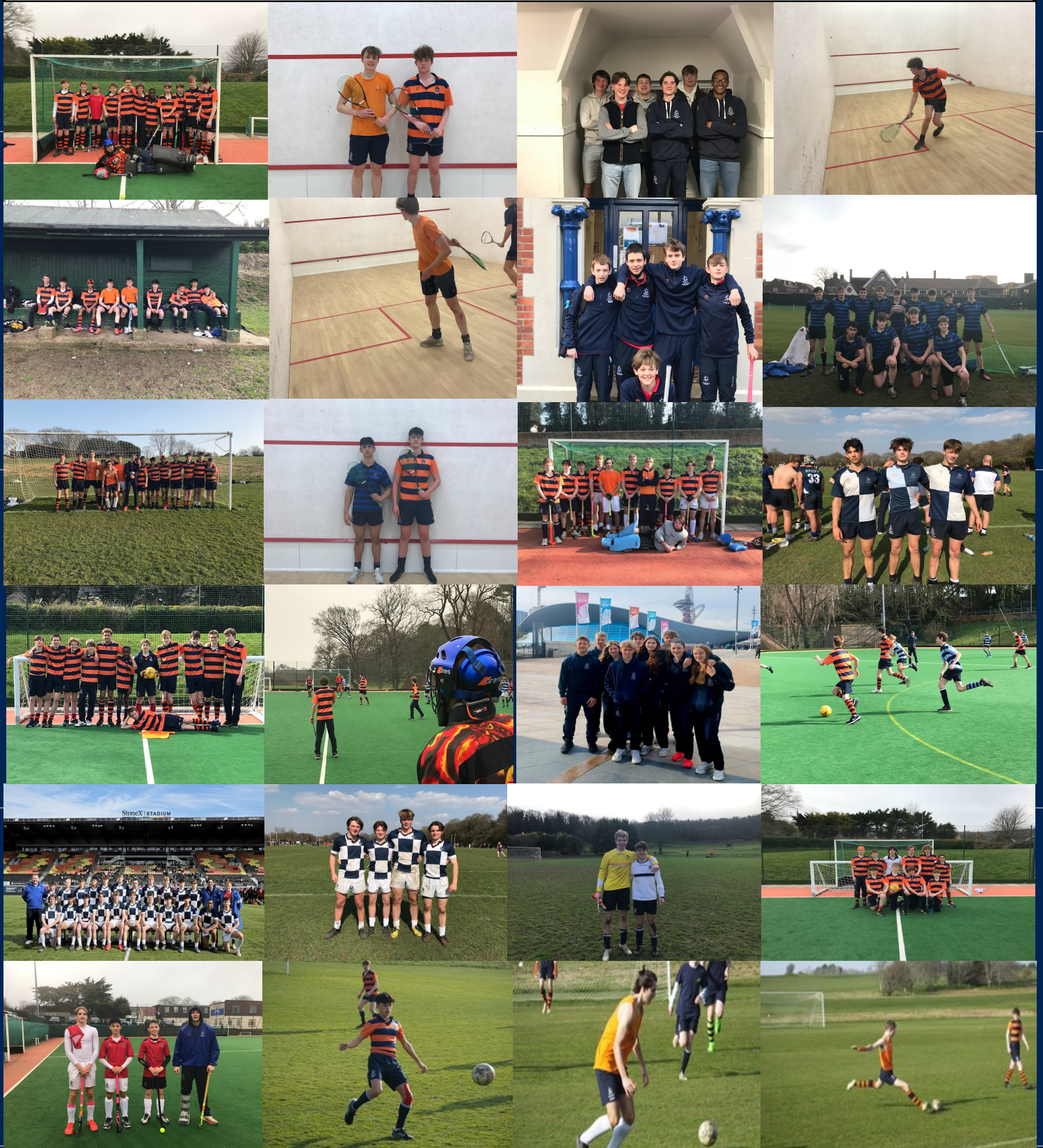
From the top row: Y9 hockey, senior squash, 1st XV before the final, more squash, inter house football matches, squash, Y9 A team hockey players, Y11s Sussex 7s, senior house football, junior squash, senior hockey, Y11 National 7s, Y9 football, Y9 hockey, senior swimming, Y9 football, rugby cup final squad, Senior National 7s, 1st XI football, Y10 football, 1st XI hockey debuts, & senior football x3.