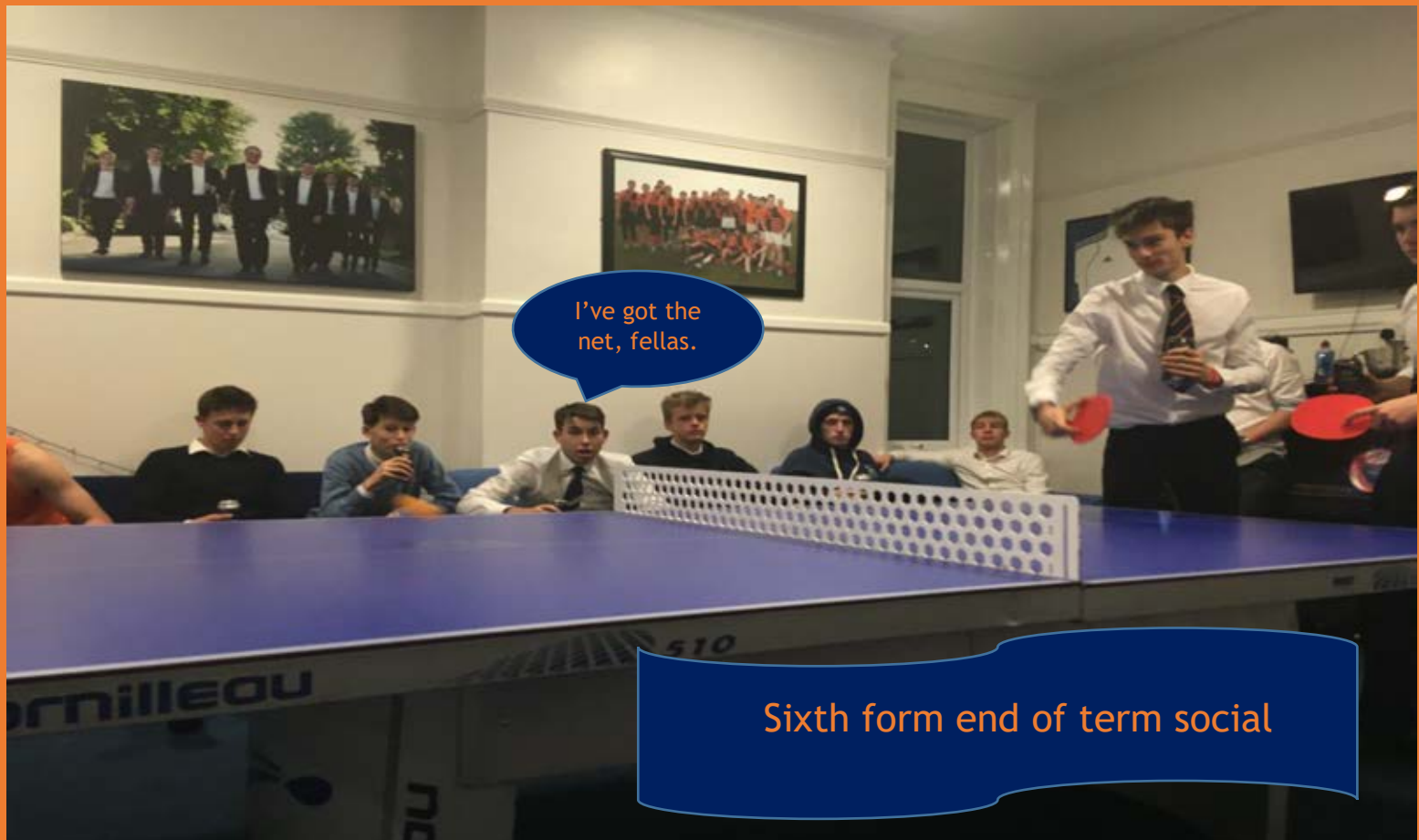
Sixth form end of term social