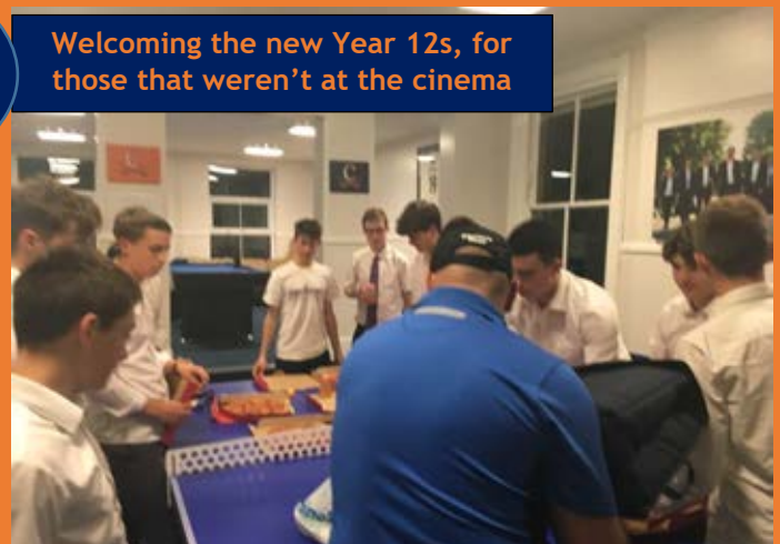
Welcoming the new Year 12s, for those that weren't at the cinema

You could have mentioned the dress code lads